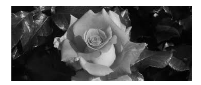
The WI Centenary Rose

Three special plants have been presented to Pashley Manor to celebrate the WI centenary and mark our special event on July 6th when we host our exclusive luncheon there. The specially commissioned rose is a Hybrid Tea which produces a profusion of large well-formed blooms and the colour is light salmon orange with contrasting pale yellow on the petals' reverse with impressive dark green foliage. For more information and to get tickets for the centenary event contact Gill on 01825 890459